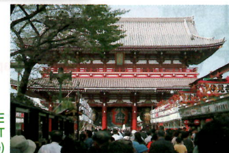
NAKAMISE SHOPPING STREET (example)