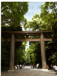
MEIJI SHRINE (example)