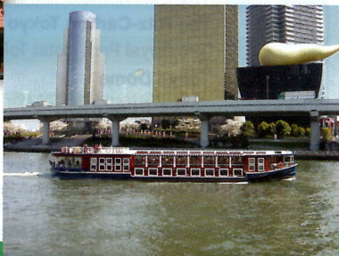
SUMIDA RIVER CRUISE (example)