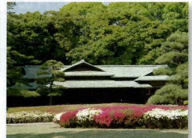
IMPERIAL PALACE EAST GARDEN (example) (Please refer to 5)