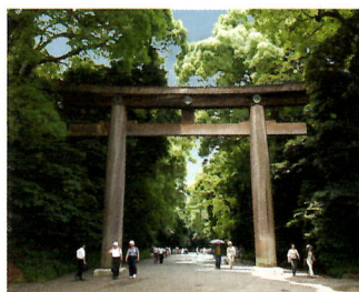
MEIJI SHRINE (example)