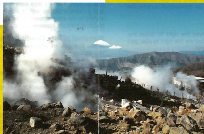
OWAKUDANI VALLEY (example)