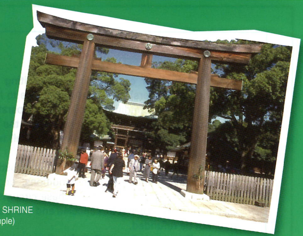
MEIJI SHRINE (example)