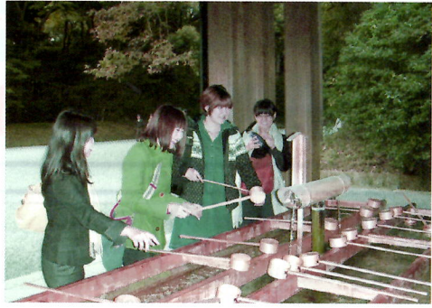
MEIJI SHRINE (example)