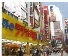
AKIHABARA (Drive through) (example)