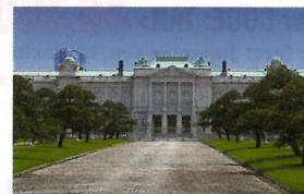
AKASAKA GUEST HOUSE (Drive by) (example)