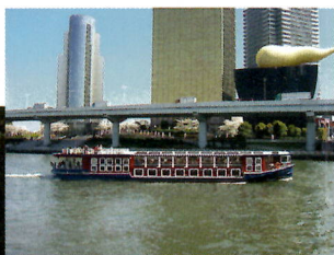
SUMIDA RIVER CRUISE (example)