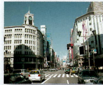
GINZA SHOPPING DISTRICT (Drive through) (example)