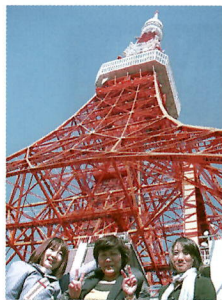
TOKYO TOWER (example)