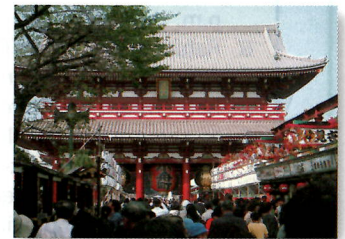
NAKAMISE SHOPPING STREET (example)