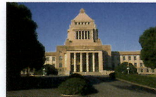
NATIONAL DIET BUILDING (Drive by) (example)