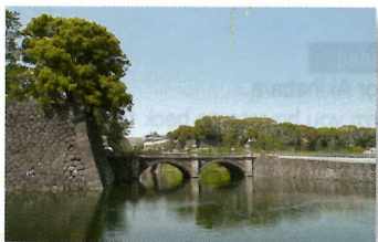
IMPERIAL PALACE, DOUBLE BRIDGE (Please refer to 5) (example)