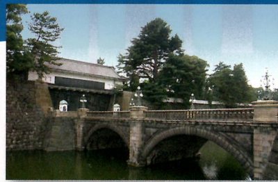
IMPERIAL PALACE, DOUBLE BRIDGE (example) (Please refer to 5)