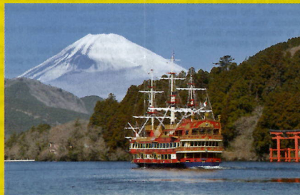
PIRATE BOAT CRUISE ON LAKE ASHI IN WINTER (example)