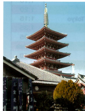
THE FIVE-STORIED PAGODA (ASAKUSA KANNON TEMPLE) (example)

Return service is available to the hotel where you were picked up. (Return service: Approx. 6:00 P.M. - Approx. 8:00 P.M.)