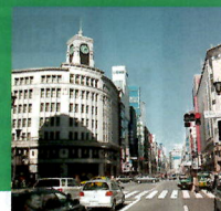
GINZA SHOPPING DISTRICT (Drive through) (example)