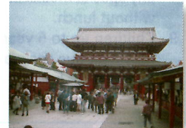
HOZOMON GATE (ASAKUSA KANNON TEMPLE) (example)