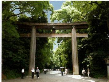
MEIJI SHRINE (example)

Tour disbands in Ginza area (approx. 1:00 P.M.). Drop-off only. Tour guide will inform you how to go back to your hotel.