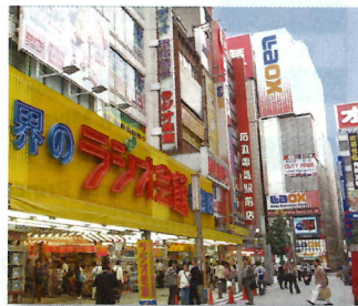
AKIHABARA (Drive through) (example)