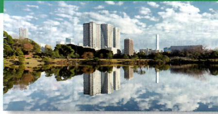
HAMA-RIKYU GARDEN (example)