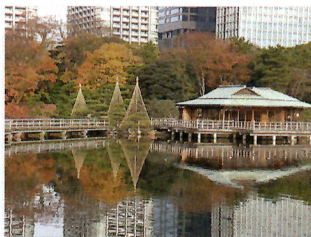
HAMA-RIKYU GARDEN (example)