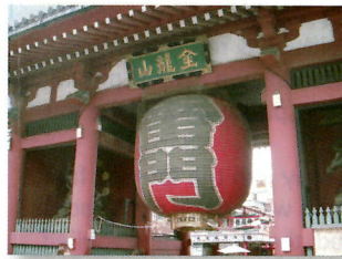
KAMINARIMON GATE (ASAKUSA KANNON TEMPLE) (example)