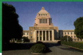
NATIONAL DIET BUILDING (Drive by) (example)

Remarks: Please read the remarks and tour conditions on page 5 and 6.