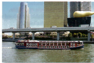
SUMIDA RIVER CRUISE (example)