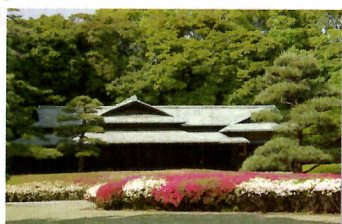
IMPERIAL PALACE EAST GARDEN (example) (Please refer to 5)