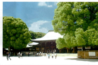
MEIJI SHRINE (example)