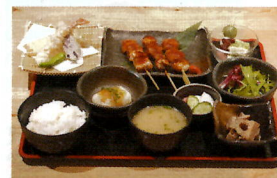
JAPANESE STYLE LUNCH (example)

Please enjoy a Japanese style lunch . Vegetarian Menu is available on request. (The location of the restaurant and the menu might be changed due to operational reasons.)