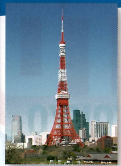
TOKYO TOWER (example)