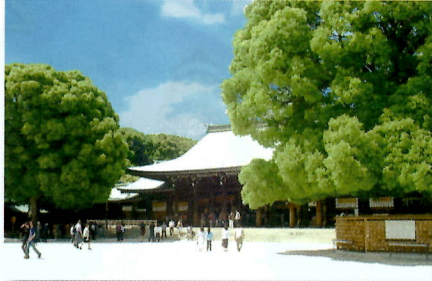
MEIJI SHRINE (example)