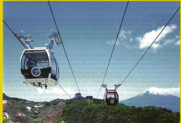
Hakone Ropeway in Owakudani in Winter (example)